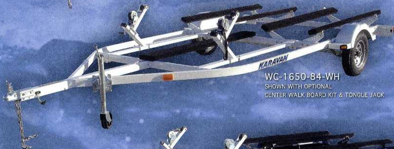
WC-1650-84-WH SHOWN WITH OPTIONAL CENTER WALK BOARD KIT & TONGUE JACK